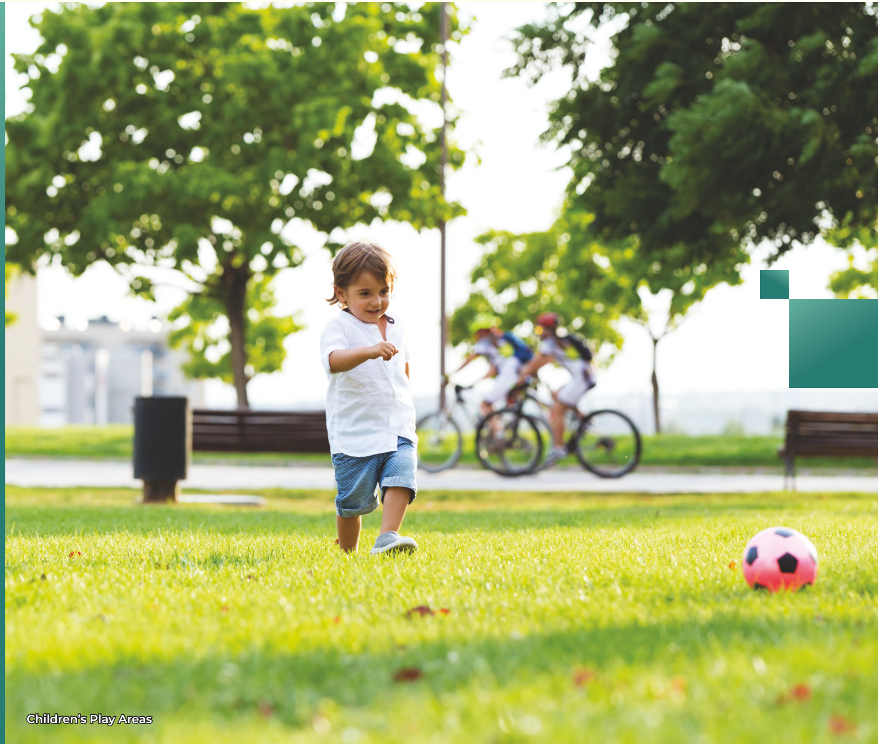
Children's Play Areas