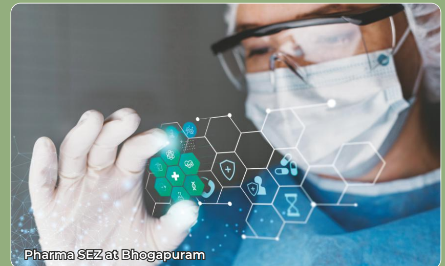
Pharma SEZ at Bhogapuram