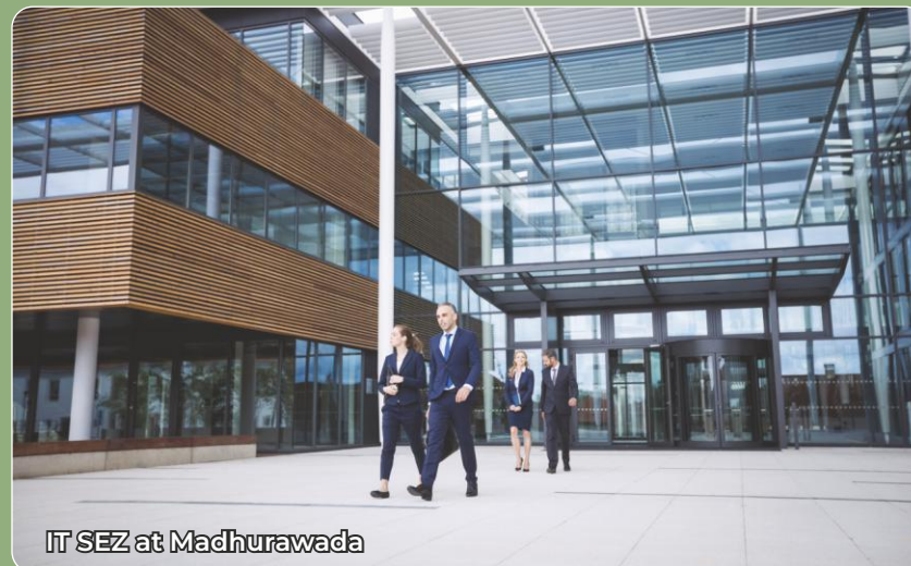
IT SEZ at Madhurawada