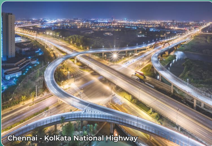
Chennai - Kolkata National Highway