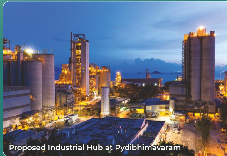
Proposed Industrial Hub at Pydibhimavaram