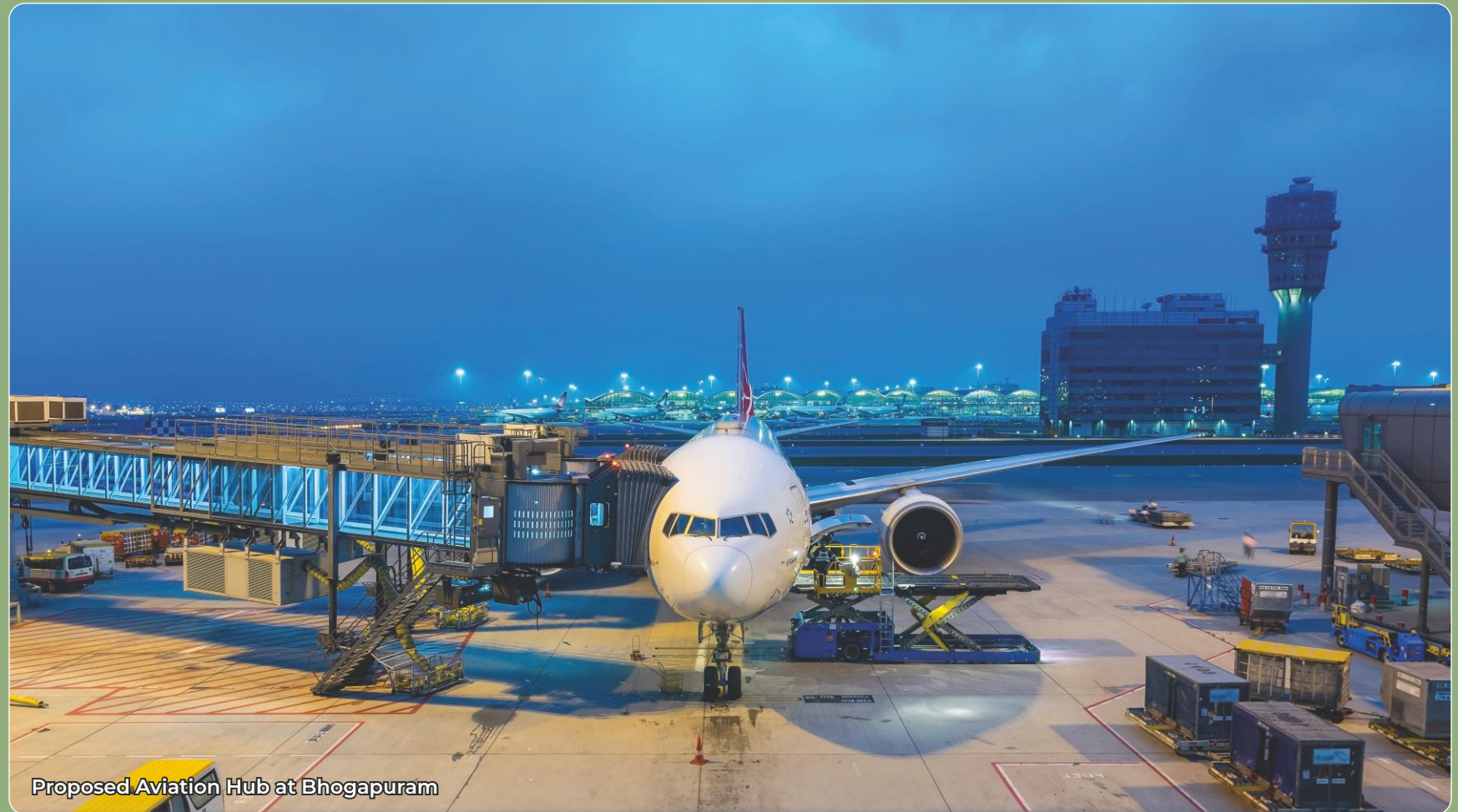
Proposed Aviation Hub at Bhogapuram