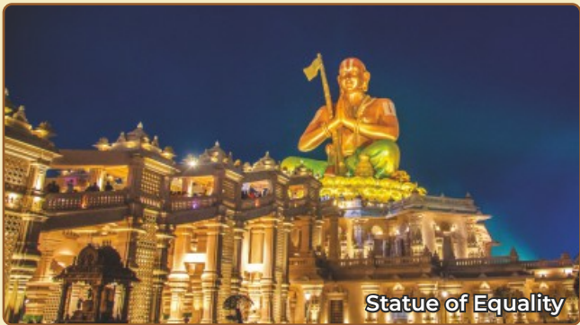
Statue of Equality