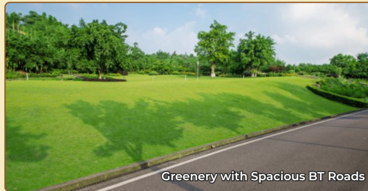
Greenery with Spacious BT Roads